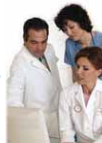
Radiology Interpretation Service, San Francisco 24/7

Through Telehealth, physicians communicate with hard-to-reach patients, exchange ideas and techniques with colleagues, transmit medical data for diagnosis and even remotely monitor patient health. For immediate medical response, much of this communication and data exchange must be done in real time.