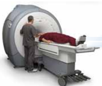
Rural Hospital 2 a.m.