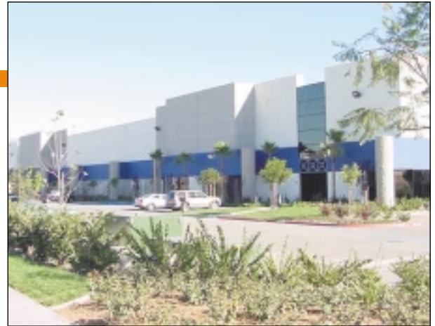
Staffed for Same Day Service