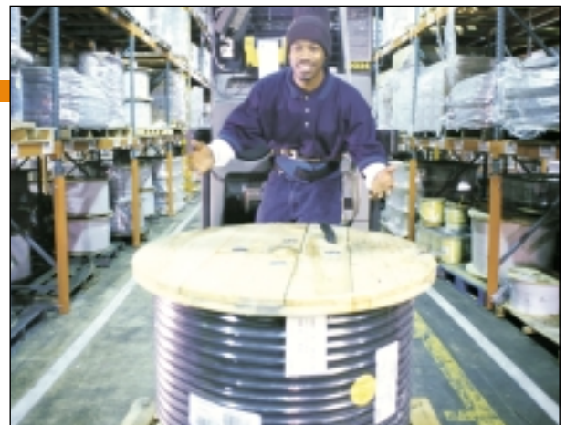
Combined Product Lines to Reduce Freight