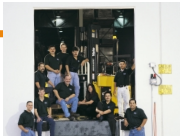
Your Order - When You Need It