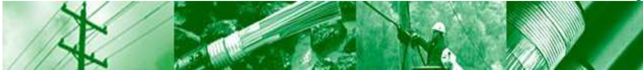
FIGURE 8 AIR CORE CABLE RDUP (RUS) PE-38 AL