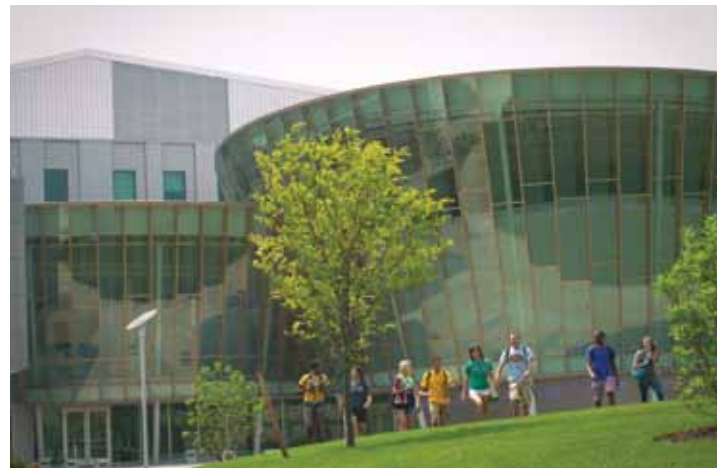
Griffin Hall, the $52.8-million home to Northern Kentucky University's College of Informatics, opened its doors to occupants in June 2011 and classes began in late August.

"If one just considers the screens in this facility—from the giant wall of dis-